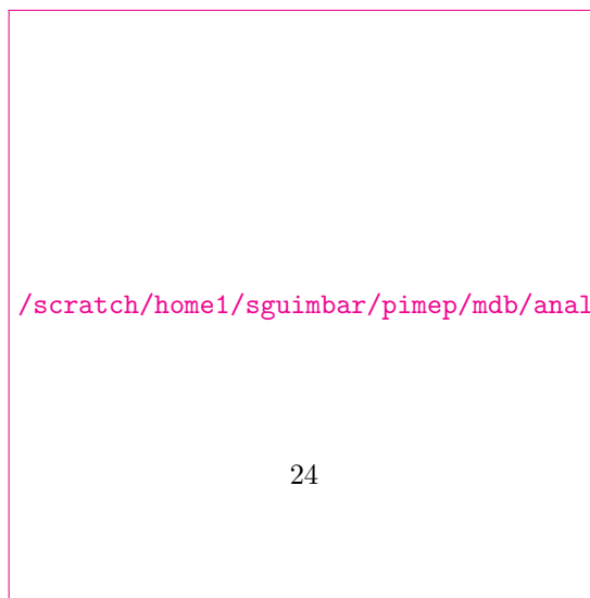
(e) Distance to coast