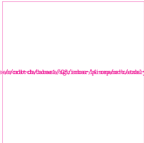
(b) Saildrone SST