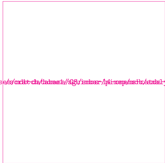
(d) CMORPH Rain rate