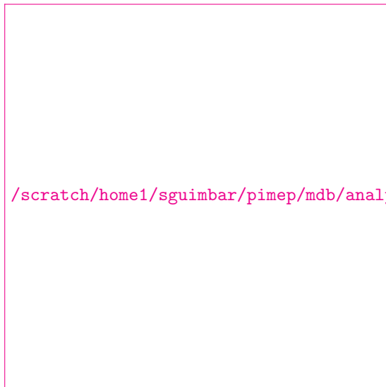
(a) Saildrone SSS