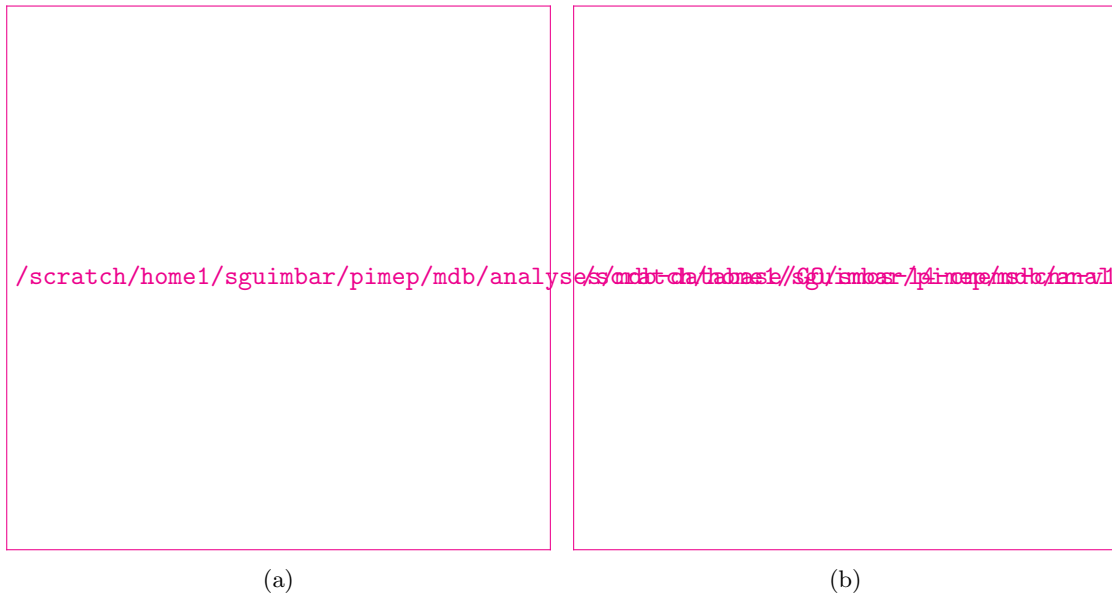
Figure 2: Histograms of SSS from Saildrone (a) and SMOS SSS L4 v1 - Monthly (CMEMS-CNR) (b) considering all match-up pairs per bins of 0.1 over the Global Ocean Pi-MEP region and for the full satellite product period.