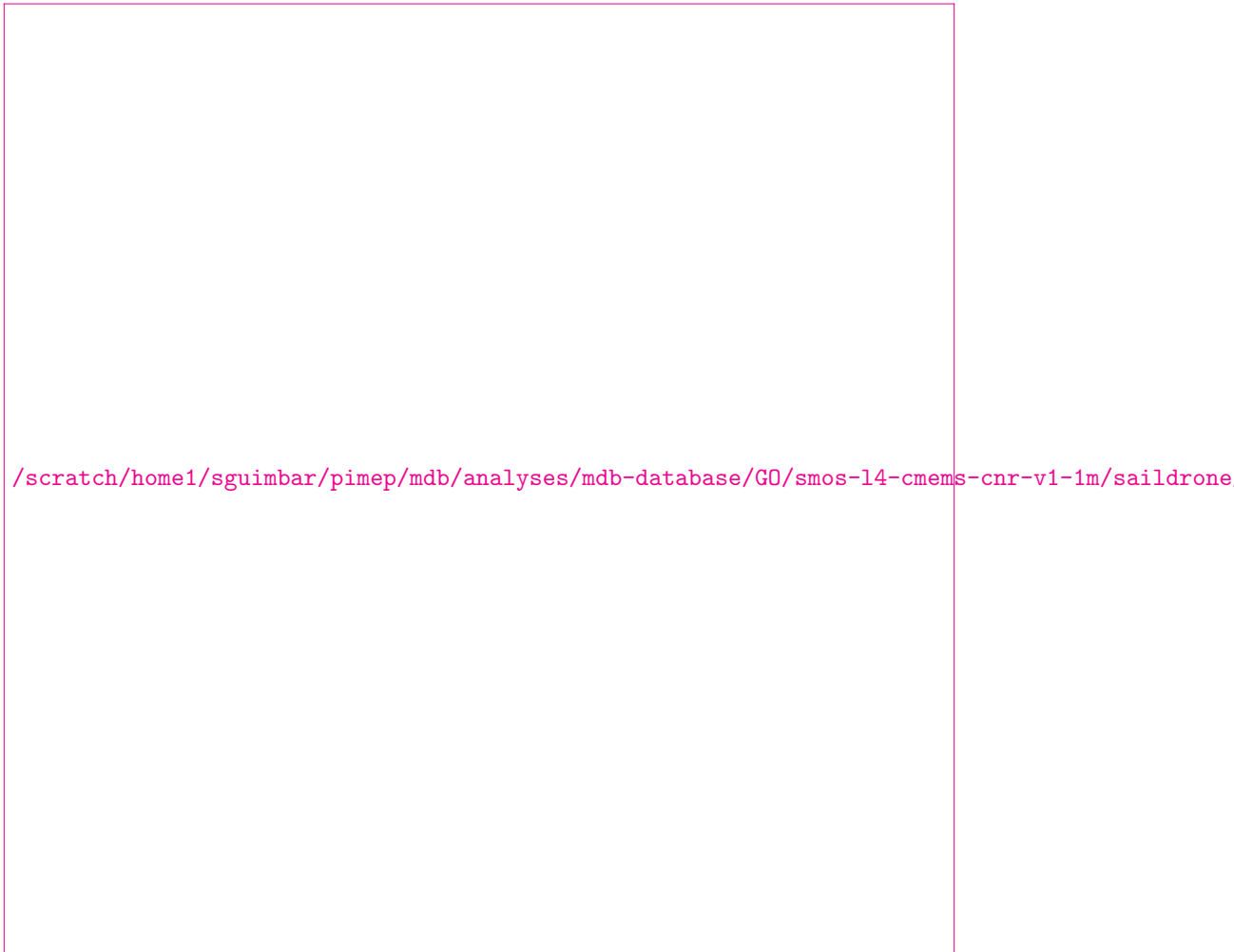
Figure 3: Number of SSS match-ups between Saildrone SSS and the SMOS SSS L4 v1 - Monthly (CMEMS-CNR) SSS product for the Global Ocean Pi-MEP region over 1^\circ \times 1^\circ boxes and for the full satellite product period.