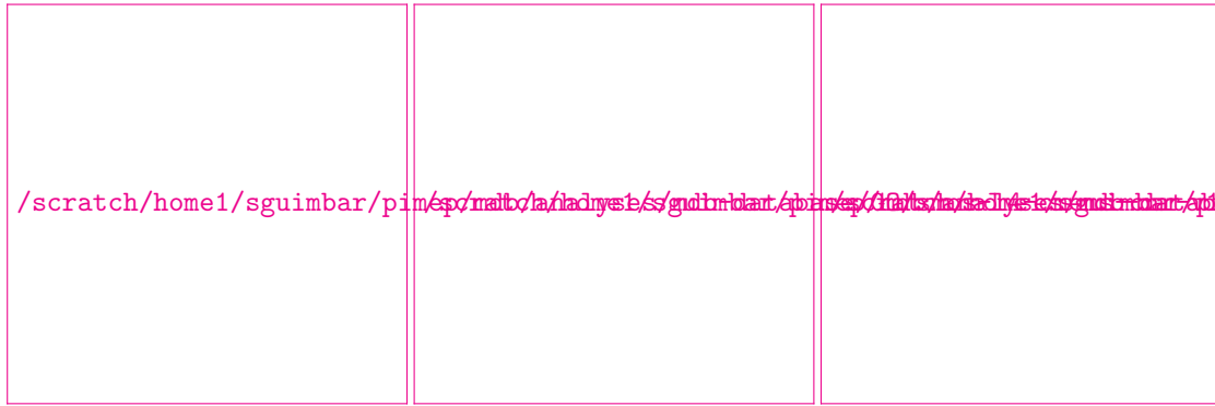
(a) RR=0 mm/h, 3 < U_{10} < 12 m/s, SST>5°C, distance to coast > 800 km