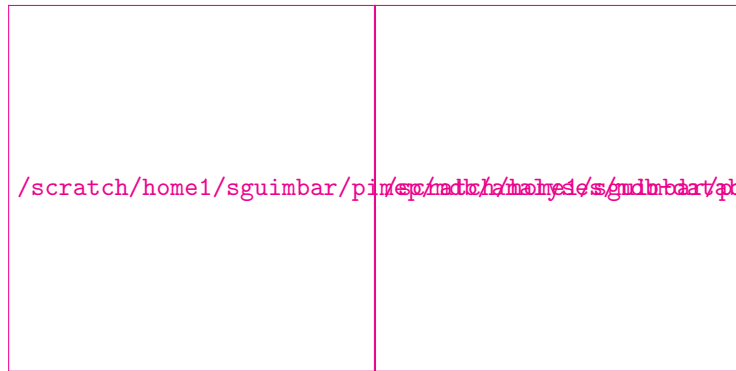
(d) WOA2013 SSS Std<0.2