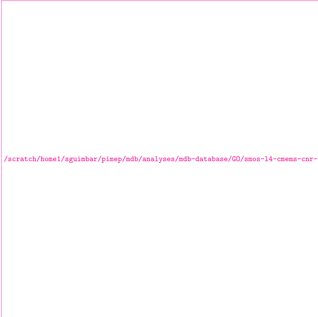
Figure 6: Time series of the monthly median SSS (top), median of \Delta SSS (Satellite - Saildrone) and Std of \Delta SSS (Satellite - Saildrone) over the Global Ocean Pi-MEP region considering all match-ups collected by the Pi-MEP.