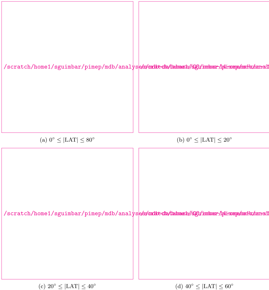
Figure 8: Contour maps of the concentration of SMOS SSS L4 v1 - Monthly (CMEMS-CNR) SSS (y-axis) versus Saildrone SSS (x-axis) at match-up pairs for different latitude bands. For each plot, the red line shows x=y . The black thin and dashed lines indicate a linear fit through the data cloud and the \pm 95\% confidence levels, respectively. The number match-up pairs n , the slope and R^2 coefficient of the linear fit, the root mean square (RMS) and the mean bias between satellite and in situ data are indicated for each latitude band in each plots.