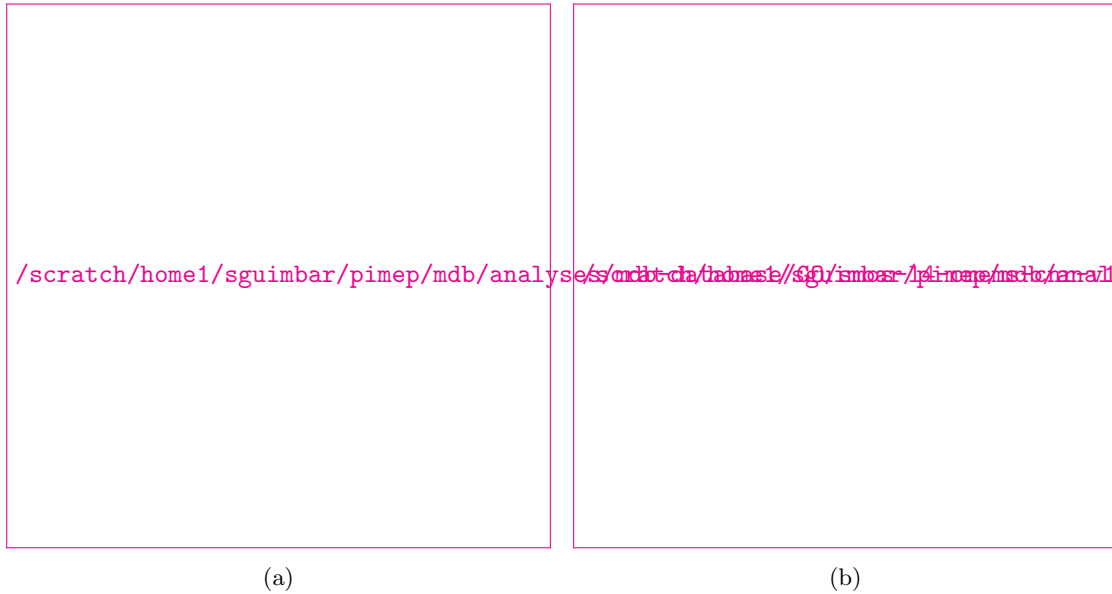
Figure 4: Histograms of the spatial (a) and temporal (b) lags between the location/time of the Sairdrone measurement and the date of the corresponding SMOS SSS L4 v1 - Monthly (CMEMS-CNR) SSS pixel.