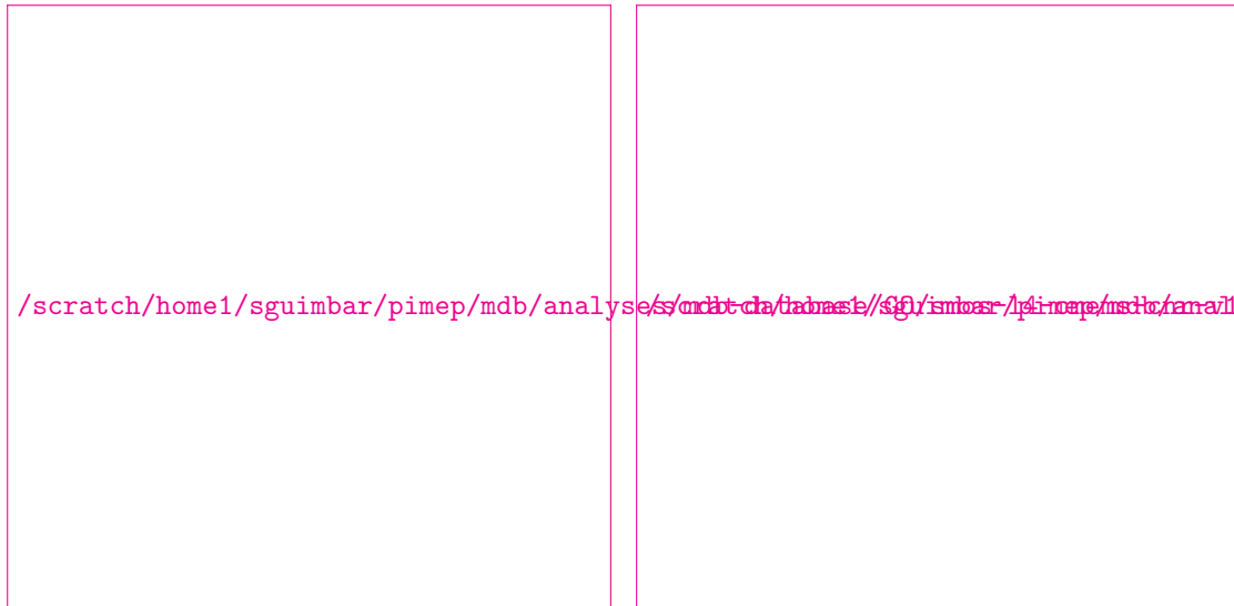
(b) Saildrone SST

/scratch/home1/sguimbar/pimep/mdb/analyses/mdb-database/GO/smos-14-cmems-cnr/analyses/saildrone/fig