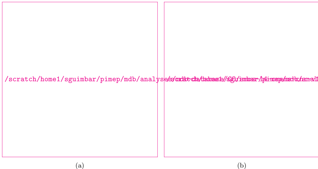
Figure 1: Number of match-ups between Saildrone and SMOS SSS L4 v1 - Monthly (CMEMS-CNR) SSS as a function of time (a) and as function of the distance to coast (b) over the Global Ocean Pi-MEP region and for the full satellite product period.

Figure 1 shows the time (a) and distance to coast (b) distributions of the match-ups between Saildrone and SMOS SSS L4 v1 - Monthly (CMEMS-CNR) for the Global Ocean Pi-MEP region and for the full satellite product period.