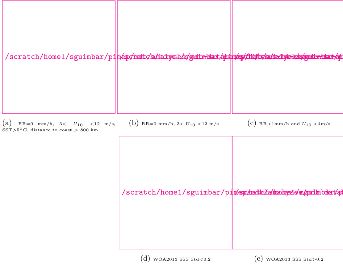
Figure 12: Normalized histogram of \Delta SSS (SMOS SSS L4 v1 - Monthly (CMEMS-CNR) - Saildrone) for 5 different subdatasets corresponding to: RR=0 mm/h, 3 < U_{10} < 12 m/s, SST>5°C, distance to coast > 800 km (a), RR=0 mm/h, 3 < U_{10} < 12 m/s (b), RR>1mm/h and U_{10} < 4 m/s (c), WOA2013 SSS Std<0.2 (d), WOA2013 SSS Std>0.2 (e).