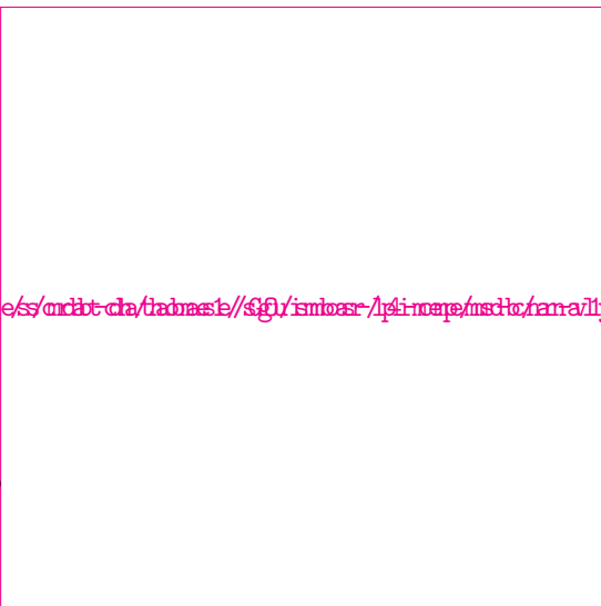
(f) Std( \Delta SSS) (Satellite - Saildrone)