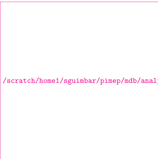
(e) MEAN( \Delta SSS) (Satellite - Saildrone)